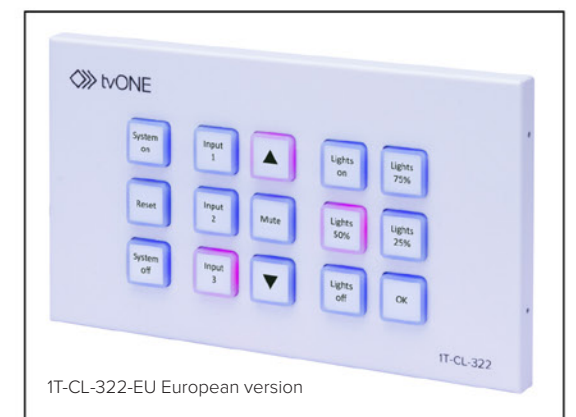
1T-CL-322-EU European version