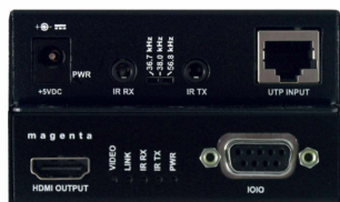
HD-ONE LX TRANSMITTER (L) AND RECEIVER (R) FRONT/BACK VIEW