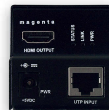
HD-ONE DX500 TRANSMITTER (L) AND RECEIVER (R) FRONT/BACK VIEW