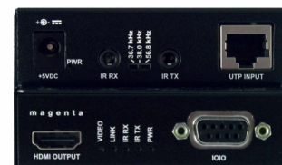
HD-ONE LX500 TRANSMITTER (L) AND RECEIVER (R) FRONT/BACK VIEW