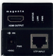
HD-ONE DX TRANSMITTER (L) AND RECEIVER (R) FRONT/BACK VIEW