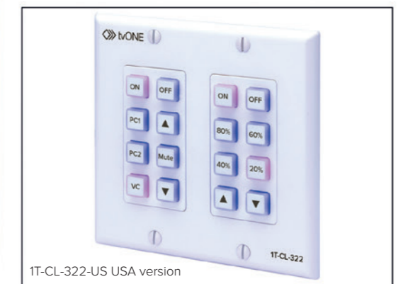
1T-CL-322-US USA version