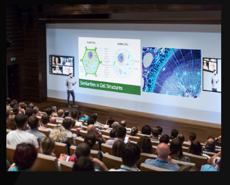
Edge Blended Projection