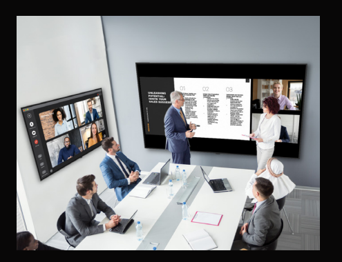
Direct View LED