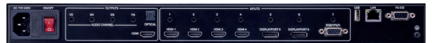
Its deceptively simple appearance disguises its extremely powerful abilities as a 4K Multiviewer / Presentation Switcher.