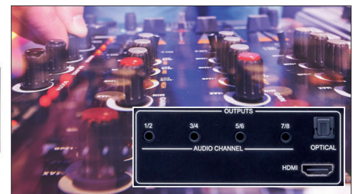
Embed / de-embed any of the 7 audio inputs