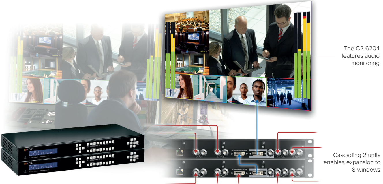
The C2-6204 features audio monitoring