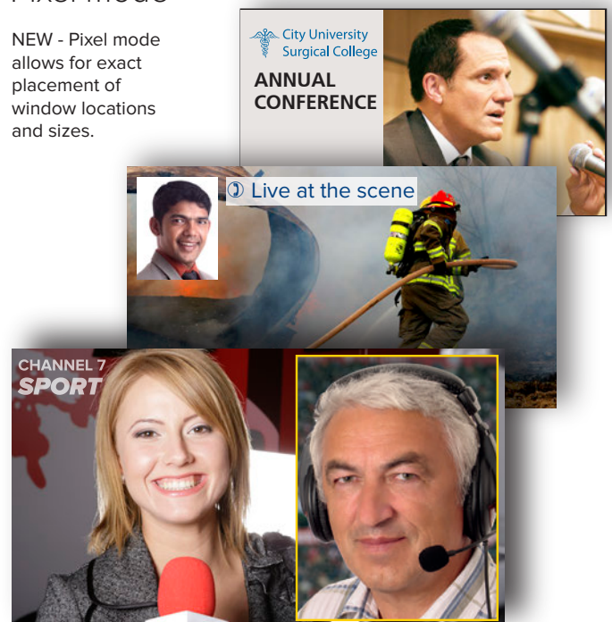
Picture-in-Picture capability - any size, any position

NEW - Pixel mode allows for exact placement of window locations and sizes.